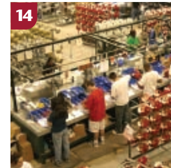
14 Teamwork is key to our game plan, and maximum efficiency gets our customers the best service.