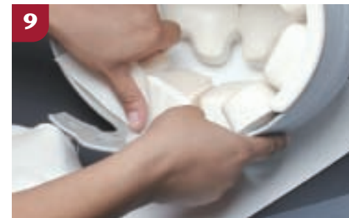
9 Air liners are inflated. Structural integrity is checked and re-checked. Stress or hairline cracks mean the helmet is rejected.