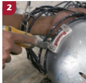
2 Face masks and hardware are removed.