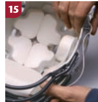
15 Accessories are re-attached.