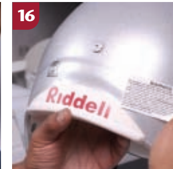
16 Original manufacturer warnings, labels and a recertification seal are applied.