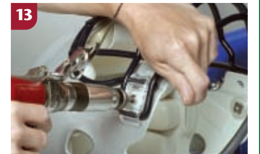
13 Snaps, rivets and hardware... expertly replaced. Your reconditioned face mask is re-attached.