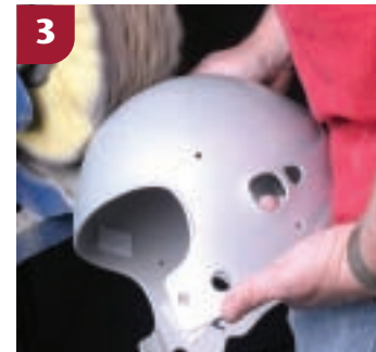
3 Buffing provides a smooth, blemish-free surface.