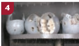
4 Helmets are sanitized by hot, pressurized water. Upgrade with Staph Fighter.