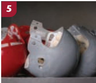
5 Helmets are immediately rinsed after sanitizing.