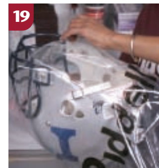
19 Final inspection... "no compromises."