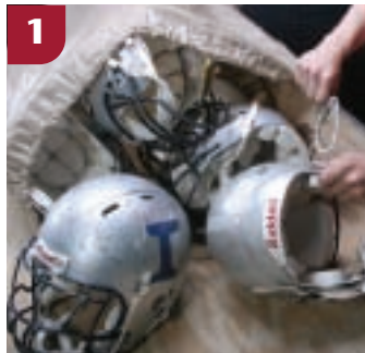
1 After your Riddell® Rep ships your team's equipment to a Riddell® plant, helmets are carefully sorted and labeled.