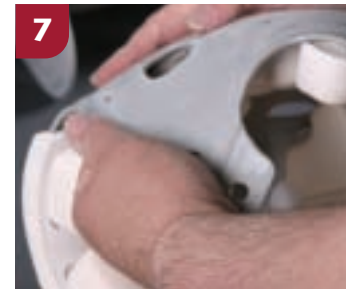
7 Helmet shells are closely inspected. Even hairline cracks keep the helmet from being recertified.