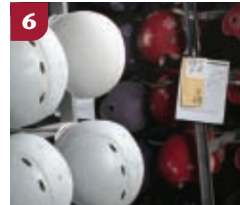
6 The warm air drying room ensures helmets are ready for the next step.