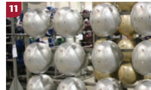
11 After helmets are sprayed with your choice of color and finish, they are again sent to dry, undisturbed.